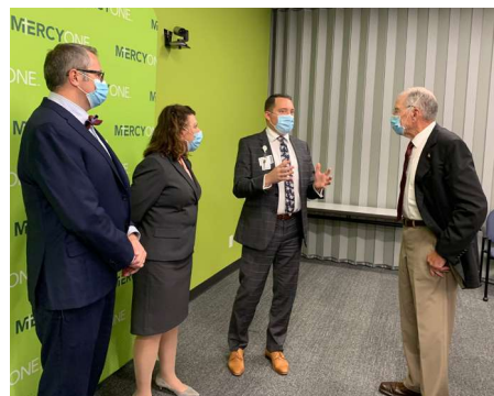
Senator Chuck Grassley meets with MercyOne's Virtually Integrated Care team.

The Consolidated Appropriations Act, passed last December, establishes a rural emergency hospital (REH) designation under the Medicare program that will allow certain existing facilities to meet a community's need for emergency