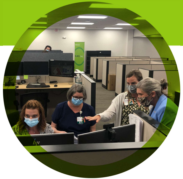
Senator Joni Ernst

future of virtually integrated care at MercyOne and how it impacts patient experience, nurse retention and innovation. Our team highlighted the need for support for health care workers as well as additional support and innovations to meet the hiring shortages.