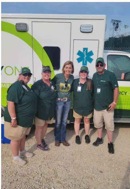
Members of MercyOne Elkader Ambulance Services with Governor Reynolds

heat exhaustion. After walking through the parking lot, through the movie site and then the corn maze to the stadium, many people were dehydrated, dizzy and exhausted.”